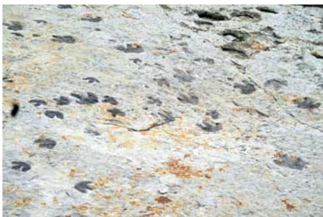
Dinosaur Tracks at Dinosaur Ridge