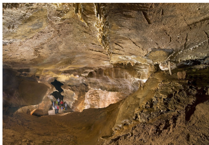
Cave of the Winds

Please check for updated pricing, availability, and hours prior to arrival at these locations.