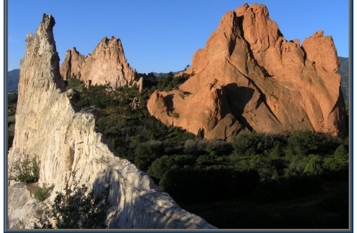
Garden of the Gods Park

Garden of the Gods is a National Natural Landmark and public park. Its beautiful rock formations are naturally formed, and the park is full of scenic hiking trails. The Visitor Center is open 9 AM to 5 PM during the winter and 9 AM to 6 PM Memorial Day weekend through Labor Day weekend. The visitor center is free and has plenty of information about the park and maps of hiking trails and formations in the park.