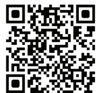
Future Me patch request form