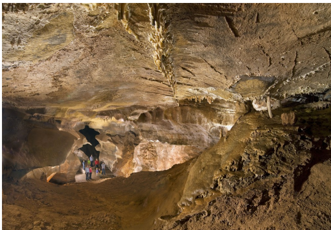
Cave of the Winds

Please check for updated pricing, availability, and hours prior to arrival at these locations.