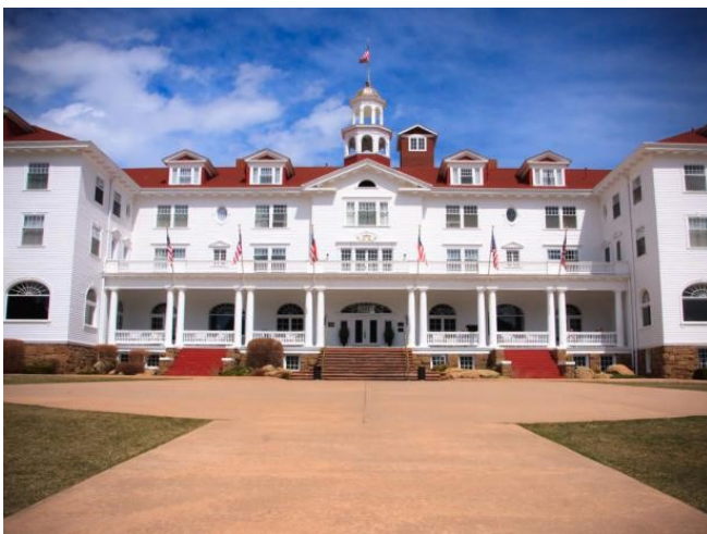
The Stanley Hotel